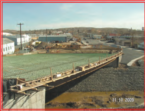
Ready to pour.