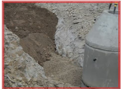
Imported backfill in rocky areas.