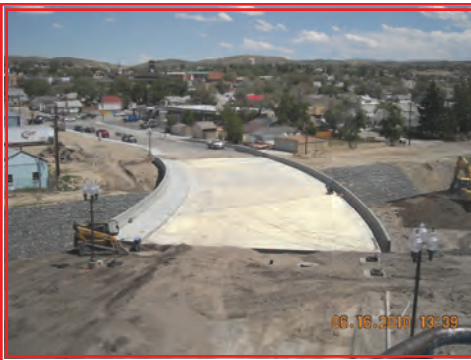
Barrier rebar installation.