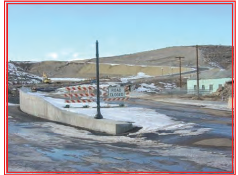
2010 Spring start-up.