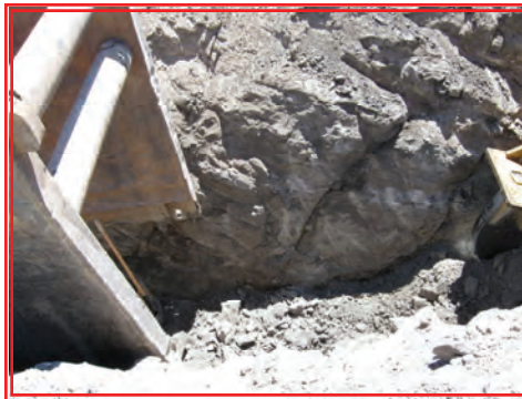
Pipe excavation in rock.