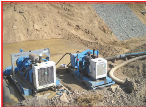
Just before being flooded out.